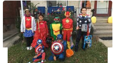
Readers' Halloween photos